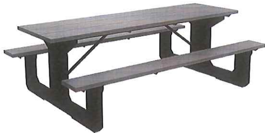
Barco / Goliath Composite Table: