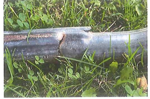
Existing table leg: