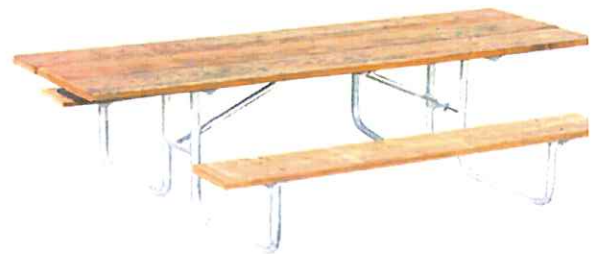
Global Industrial / Ultrasite Wood Table: