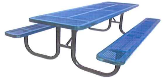
HD / Ultrasite Steel Perforated Table: