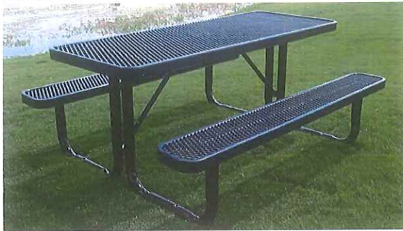
Belson Steel Perforated Table: